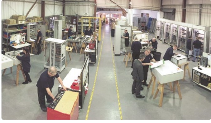
Panel building workshop at W H Good Automation