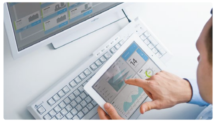
Siemens WinCC SCADA

To arrange a visit to see how we may assist you, call us on 01706 211416 or e-mail us at automation@whgood.co.uk .